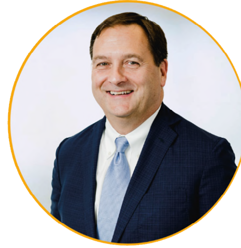
Hon. Chris Carney