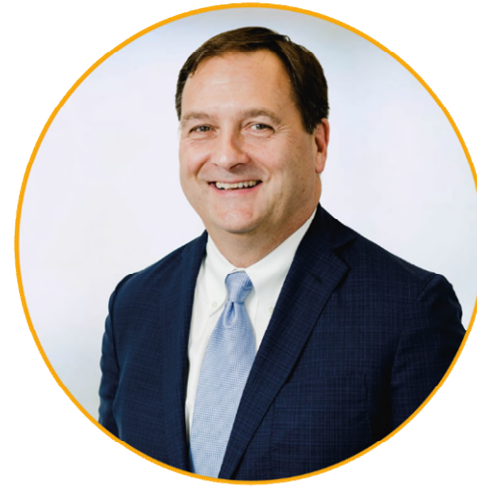
Hon. Chris Carney